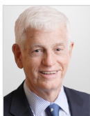
MARIO J. GABELLI, CFA Chief Executive Officer GAMCO Investors, Inc.