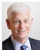
MARIO J. GABELLI, CFA Chief Executive Officer GAMCO Investors, Inc.